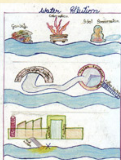
Pure Ganga Mehul Dubey V-A