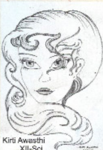
Kirti Awasthi XII-Sci.