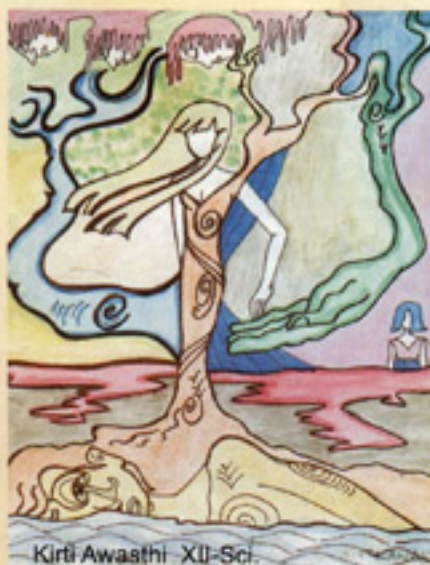
Kirti Awasthi XII-Sci