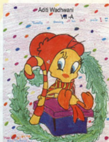
Aditi Wadhvani VII-A