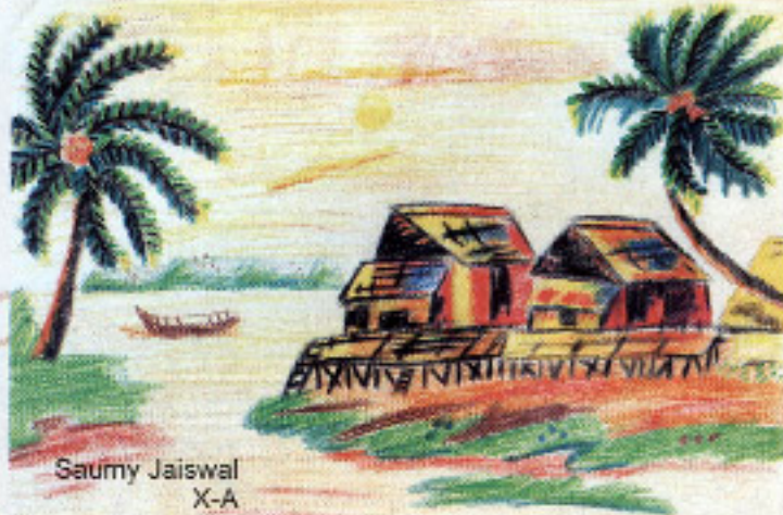
Saumy Jaiswal X-A