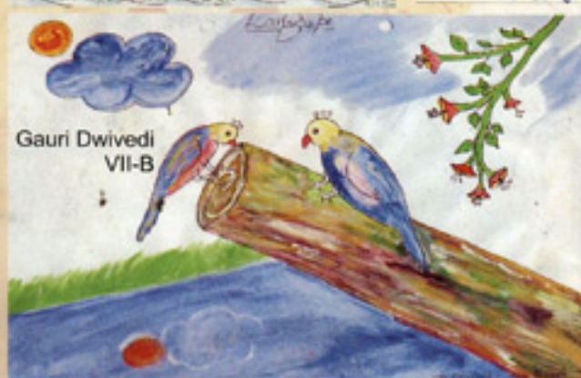
Gauri Dwivedi VII-B