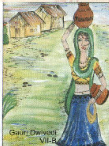
Gauri Dwivedi VII-B