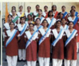
School Cabinet 2010-11