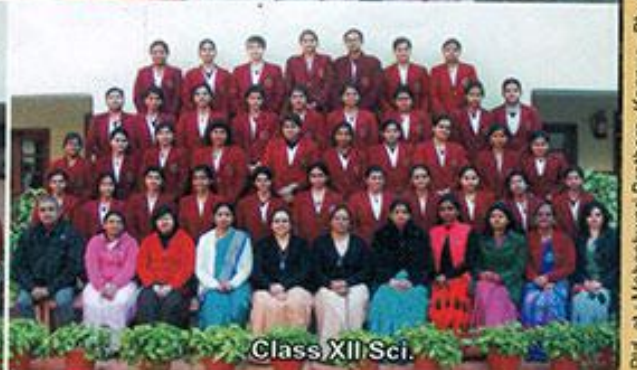
Class XII Sci.

Printed at: Maheshwari Brothers, Kanpur - Ph.: 2378419