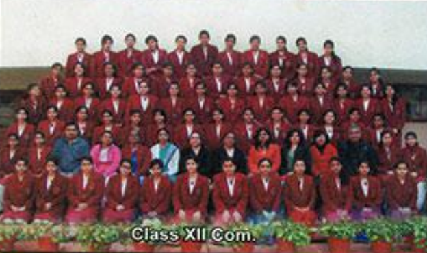
Class XII Com.