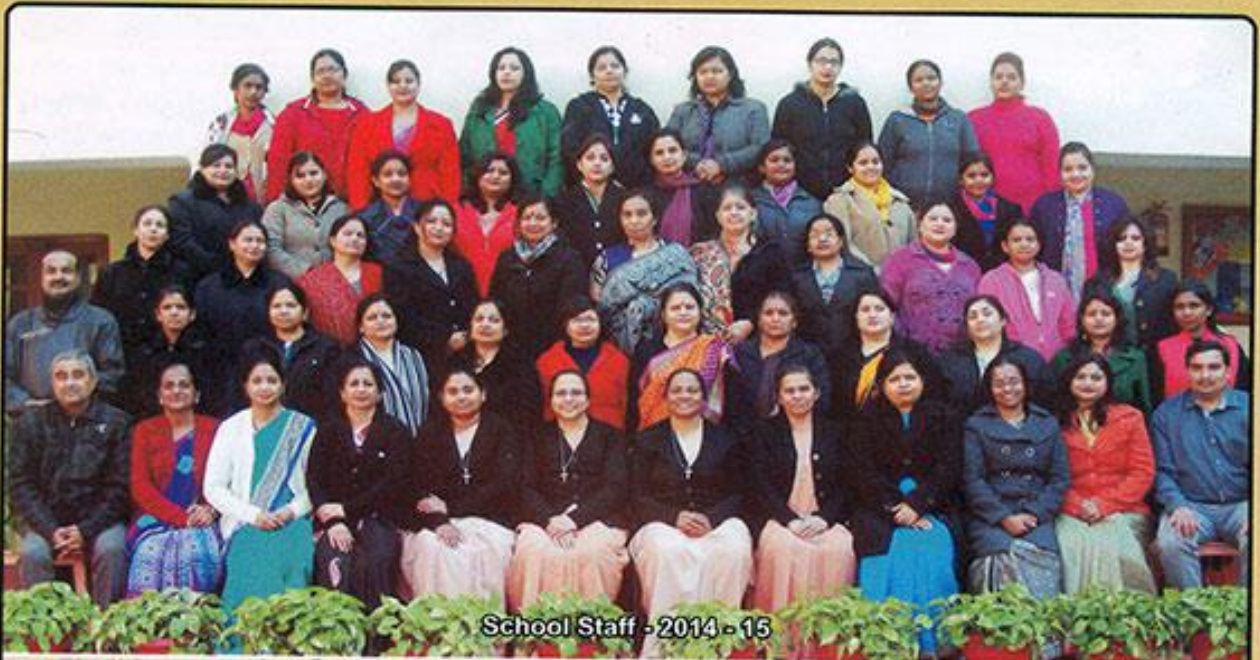
School Staff - 2014 - 15