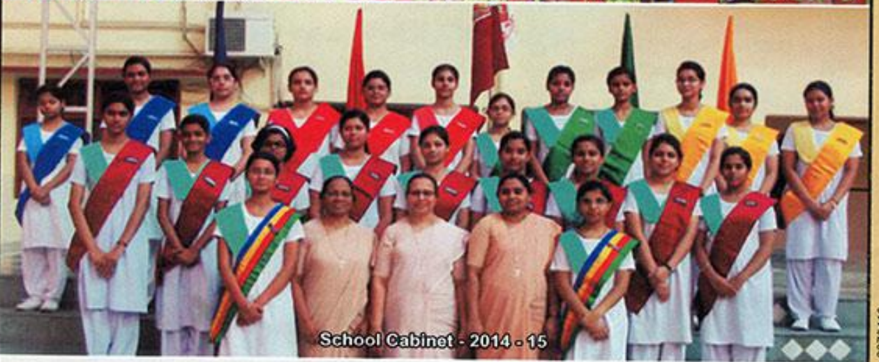
School Cabinet - 2014 - 15